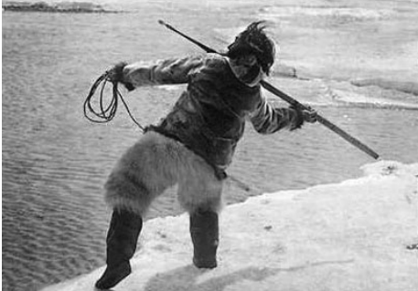
Nanook of the North, Robert Joseph Flaherty, 1922 (left and right)

Inuit in Nanook Revisited (1994) they too laughed uproariously, though one of the elders acknowledged that this was once real practice.