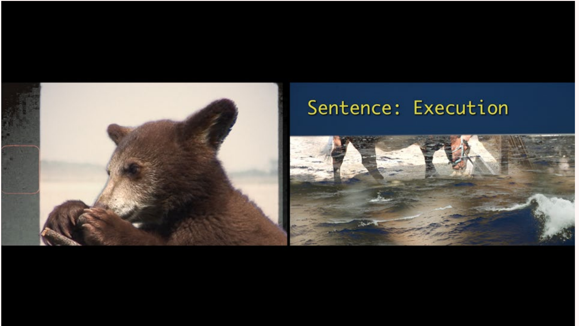
M and M Still Execution