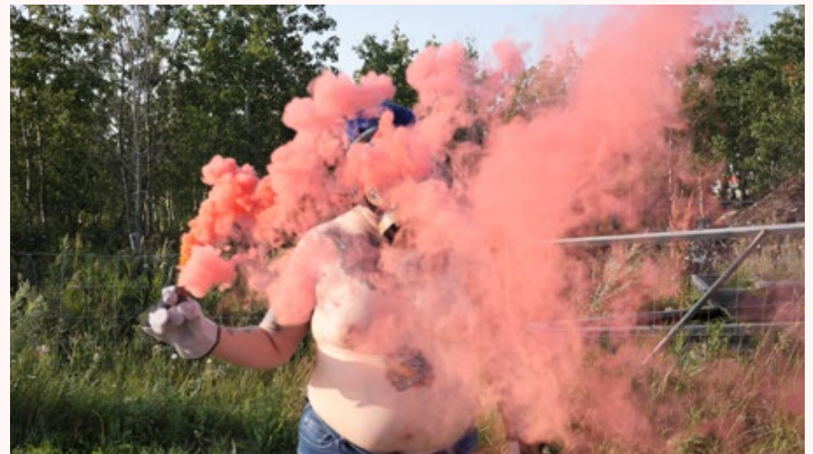
Less Lethal Fetishes

Naked and raw in body and thought, Cuthand delivers a monologue drawing connections between gas mask fetishes, breath play, the ethics of exhibiting as an artist, and environmental racism in Canada.