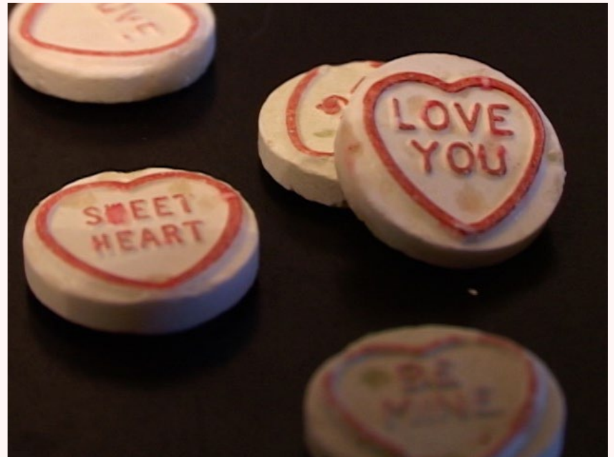
Love and Numbers

Binary code, spy signals, paranoia, and unrequited love. A Two-Spirited woman in a psychiatric hospital attempts to make sense of heartbreak and the effects of colonial violence during a mental health crisis.