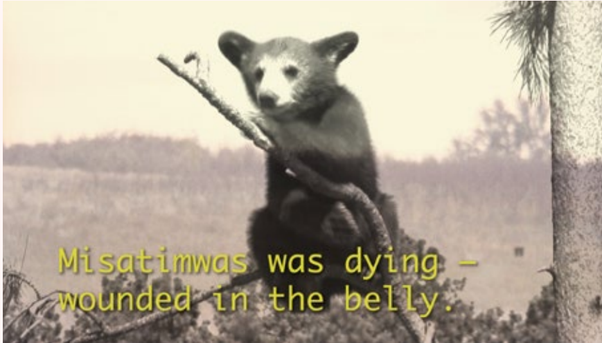
Bears Still dying