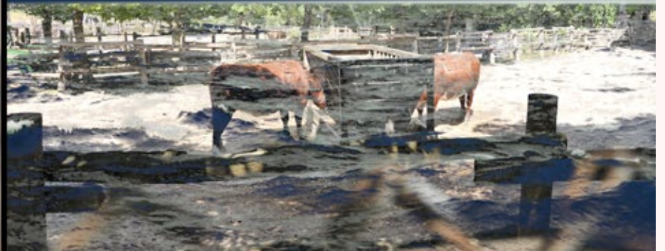
M and M Still Water