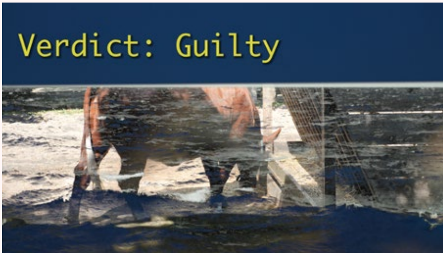
Cows Still Gulty